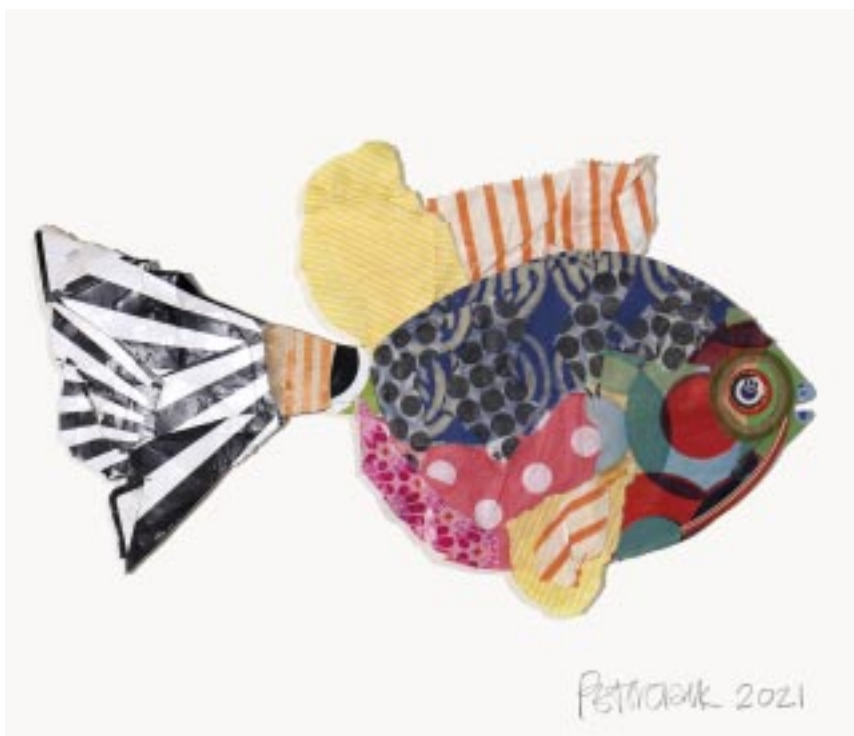
Fancy Fish VI