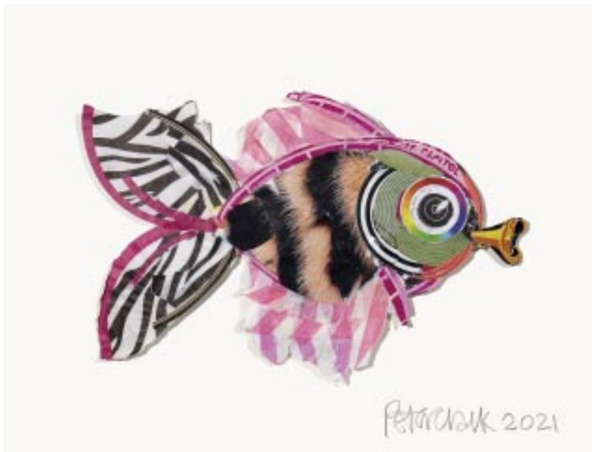
Fancy Fish III