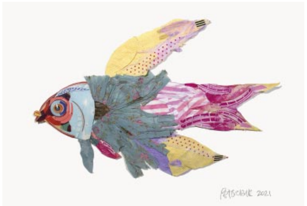
Fancy Fish V Collage 16 x 24 ins Catalogue no.31