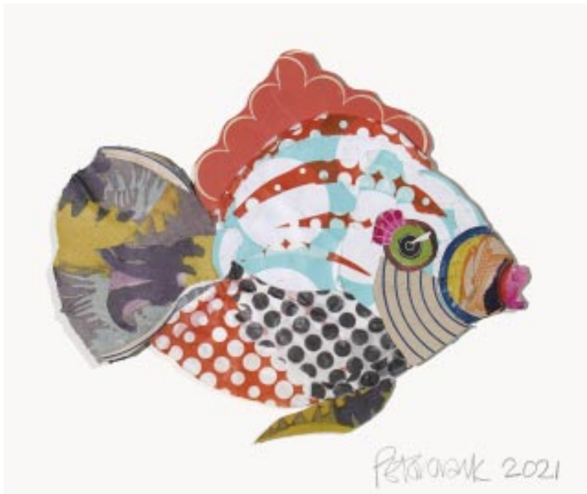
Fancy Fish VII