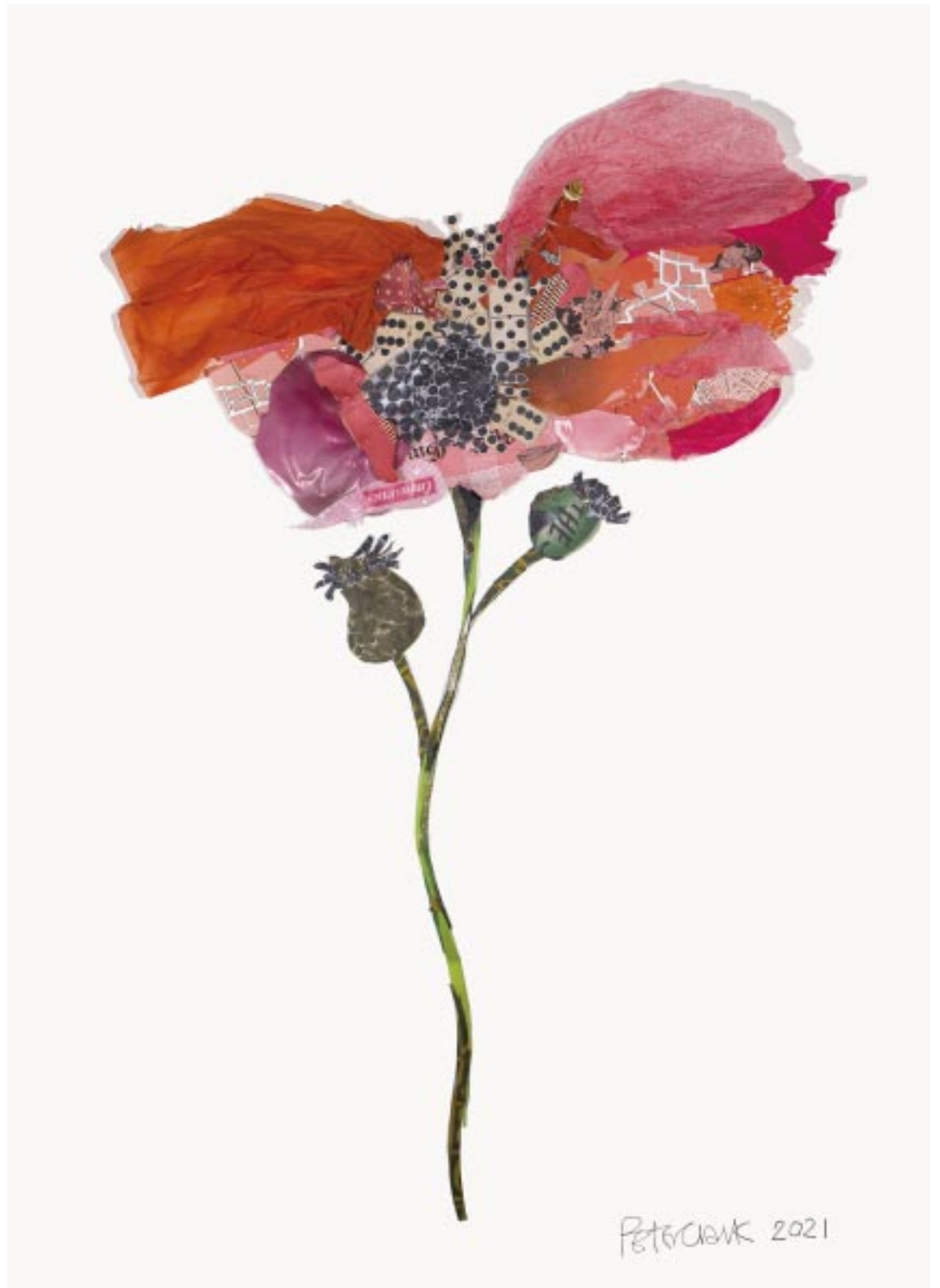
Poppy Collage 34 x 24 ins