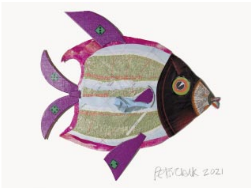
Fancy Fish I