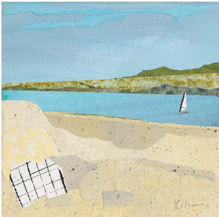
Day Out on the Water Collage 8 x 8 ins Catalogue no.46