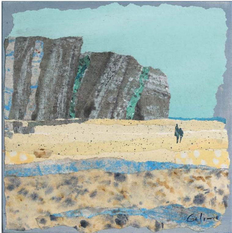
Walk by the Cliffs Collage 8 x 8 ins Catalogue no.45