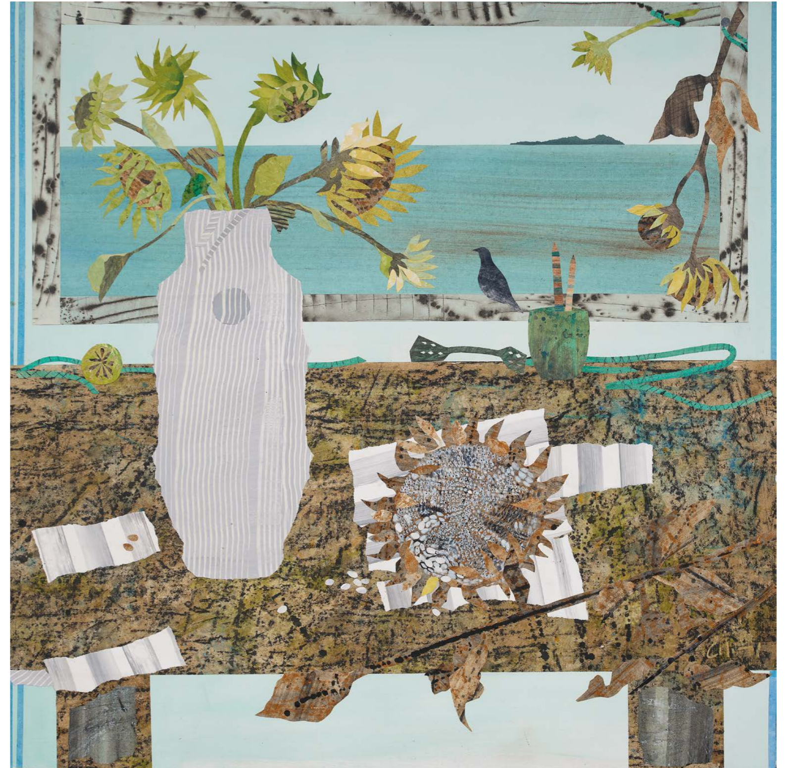
Right: Sunflowers by the Sea Collage 40 x 39 ins Catalogue no.2