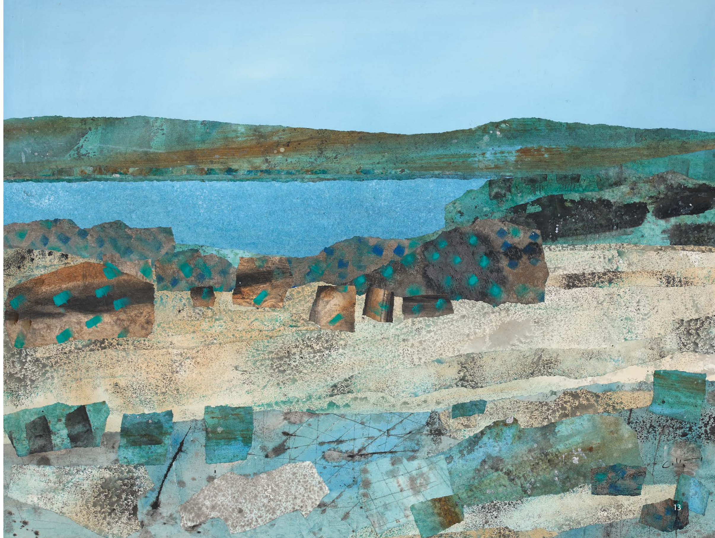
Light on the Water Collage 31 x 39 ins Catalogue no. 10