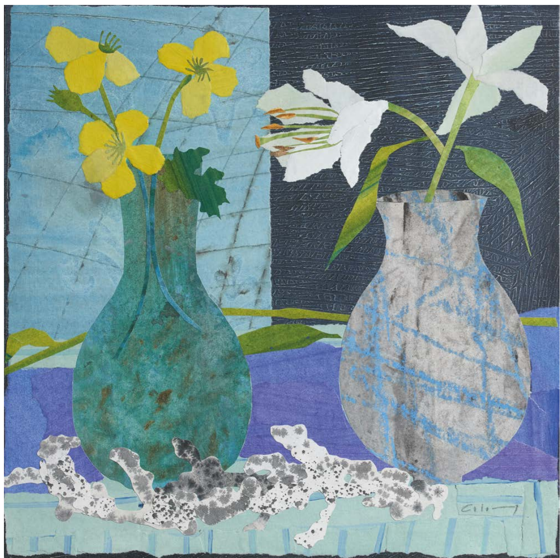
Lilies and Poppies Collage 16 x 16 ins Catalogue no.26