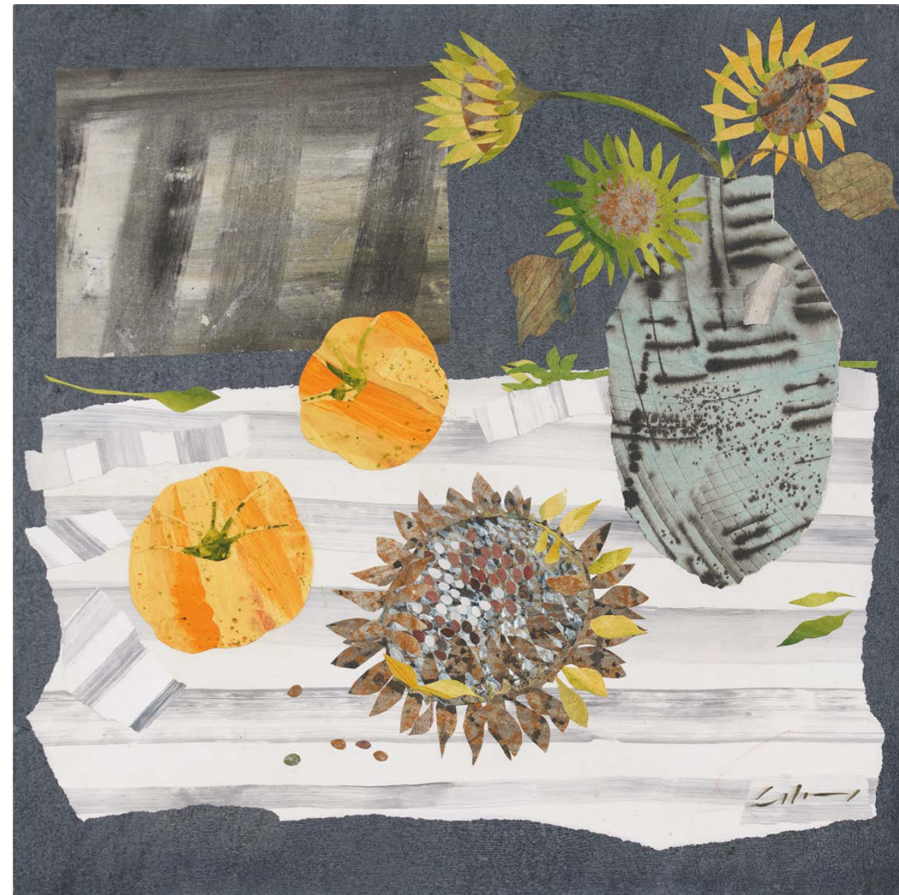
Squash and Sunflower Collage 24 x 24 ins Catalogue no.17