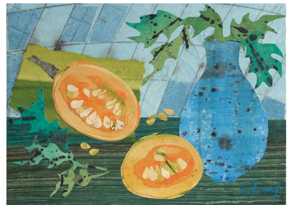
Squash Collage 9 x 12 ins Catalogue no.40