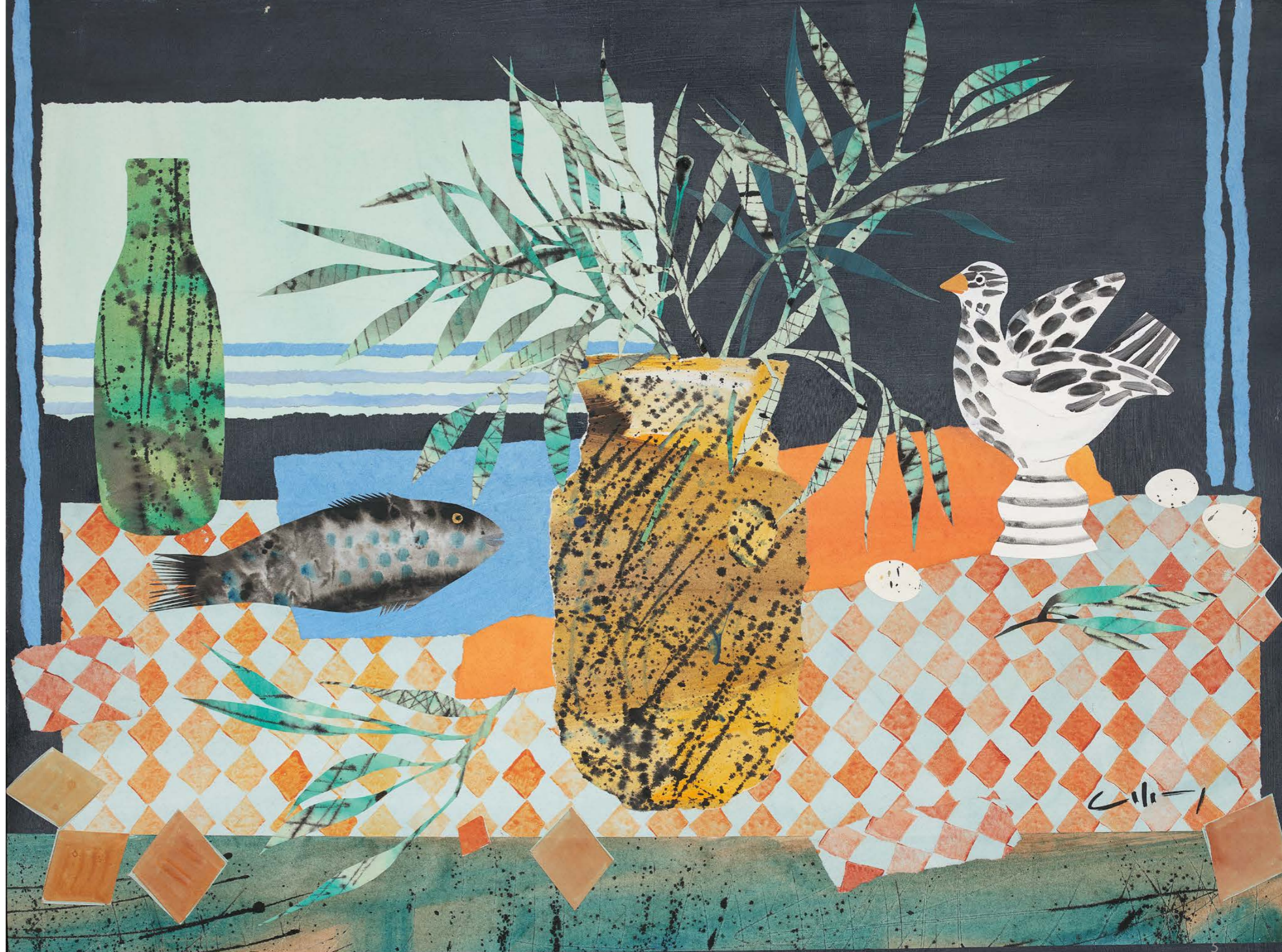
Picasso's Bird Collage 32 x 39 ins Catalogue no. 9