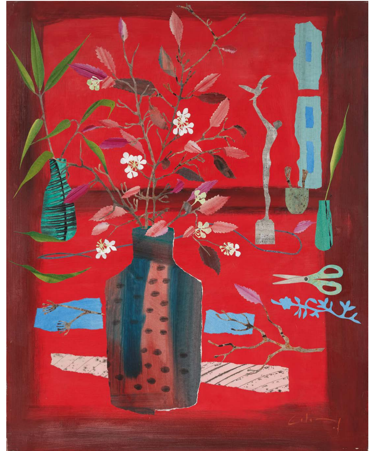
Right: Late Flowering Viburnum Collage 40 x 32 ins Catalogue no.7