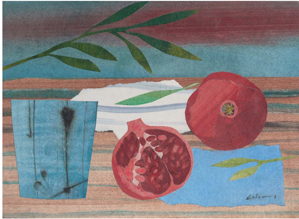
Pomegranates Collage 9 x 12 ins Catalogue no.37