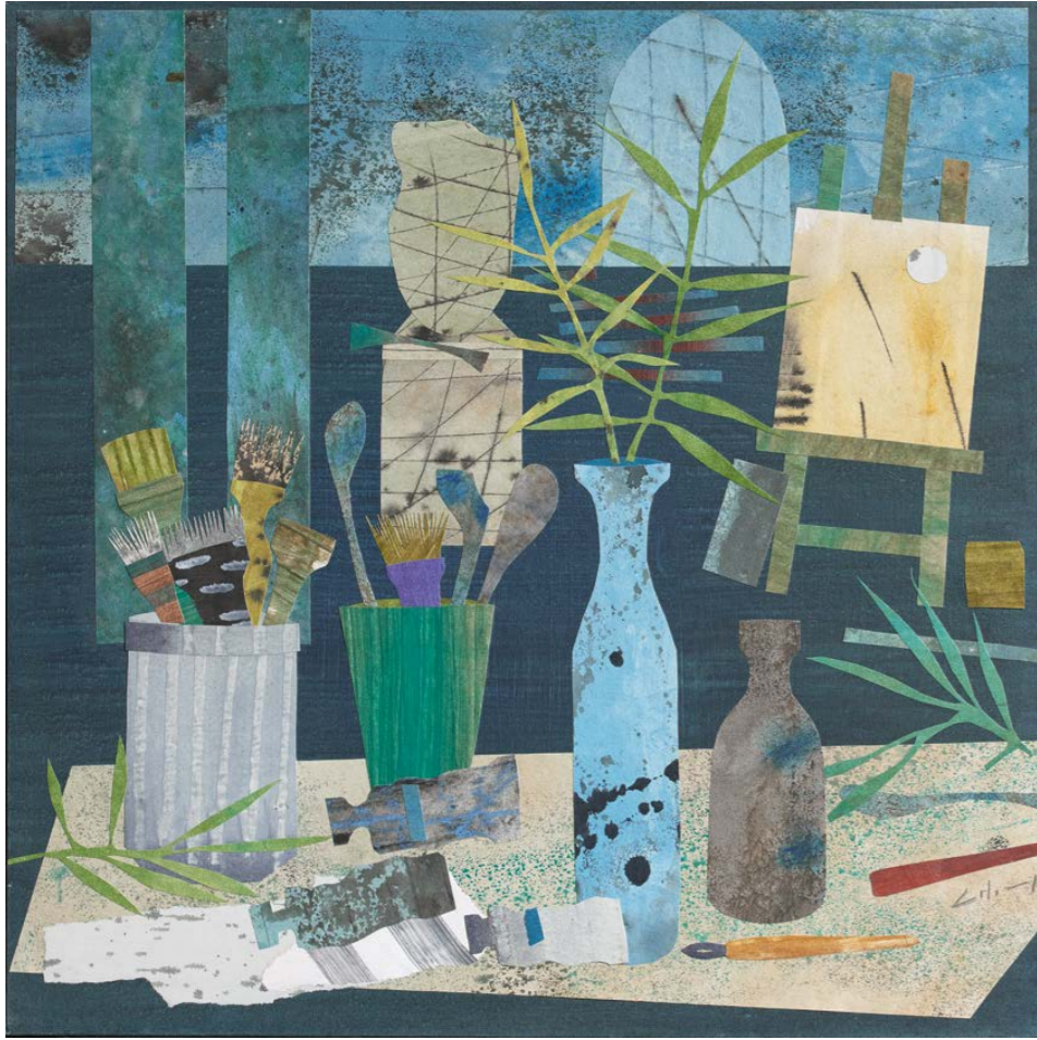
Brushes and Paints II Collage 16 x 16 ins Catalogue no.25