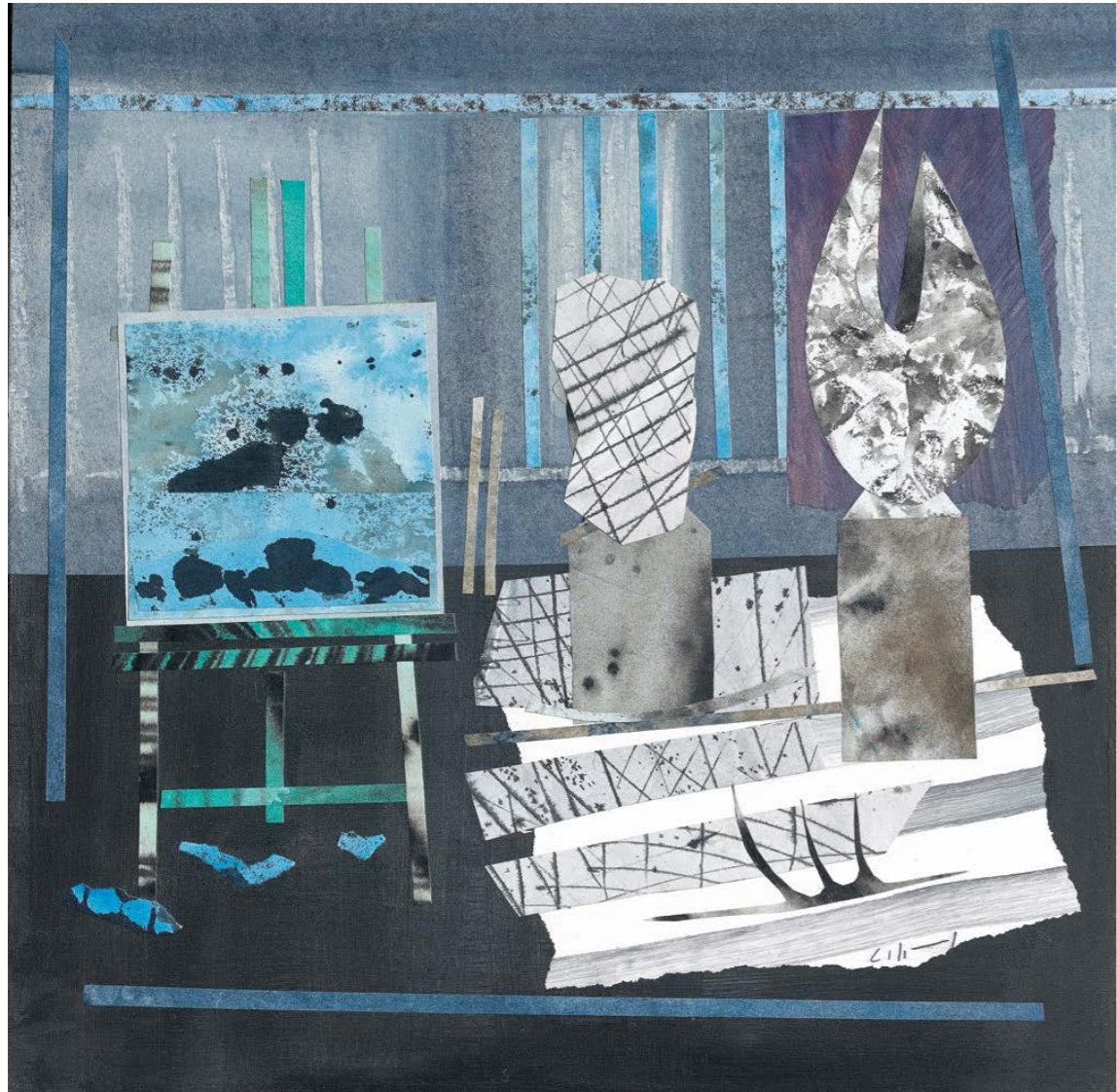
Two Sculptures in the Studio