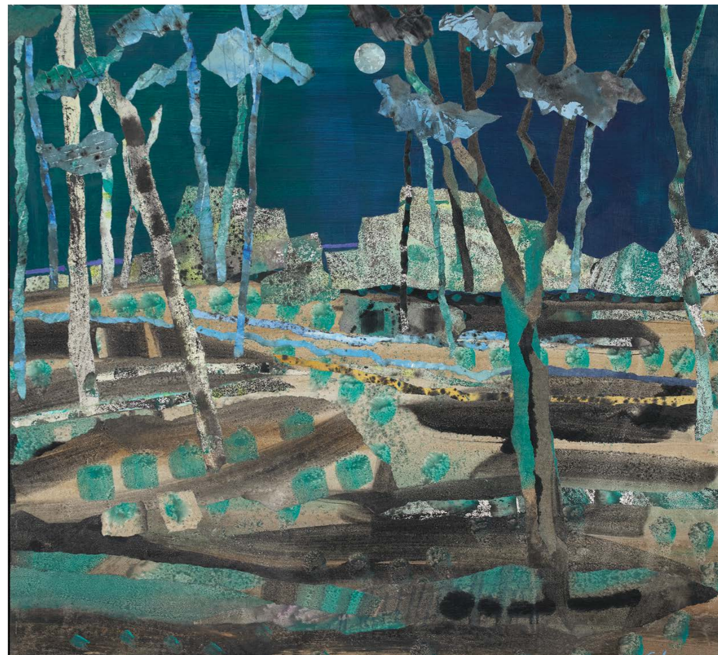
Full Moon on the Rocks Collage 32 x 31 ins Catalogue no.15