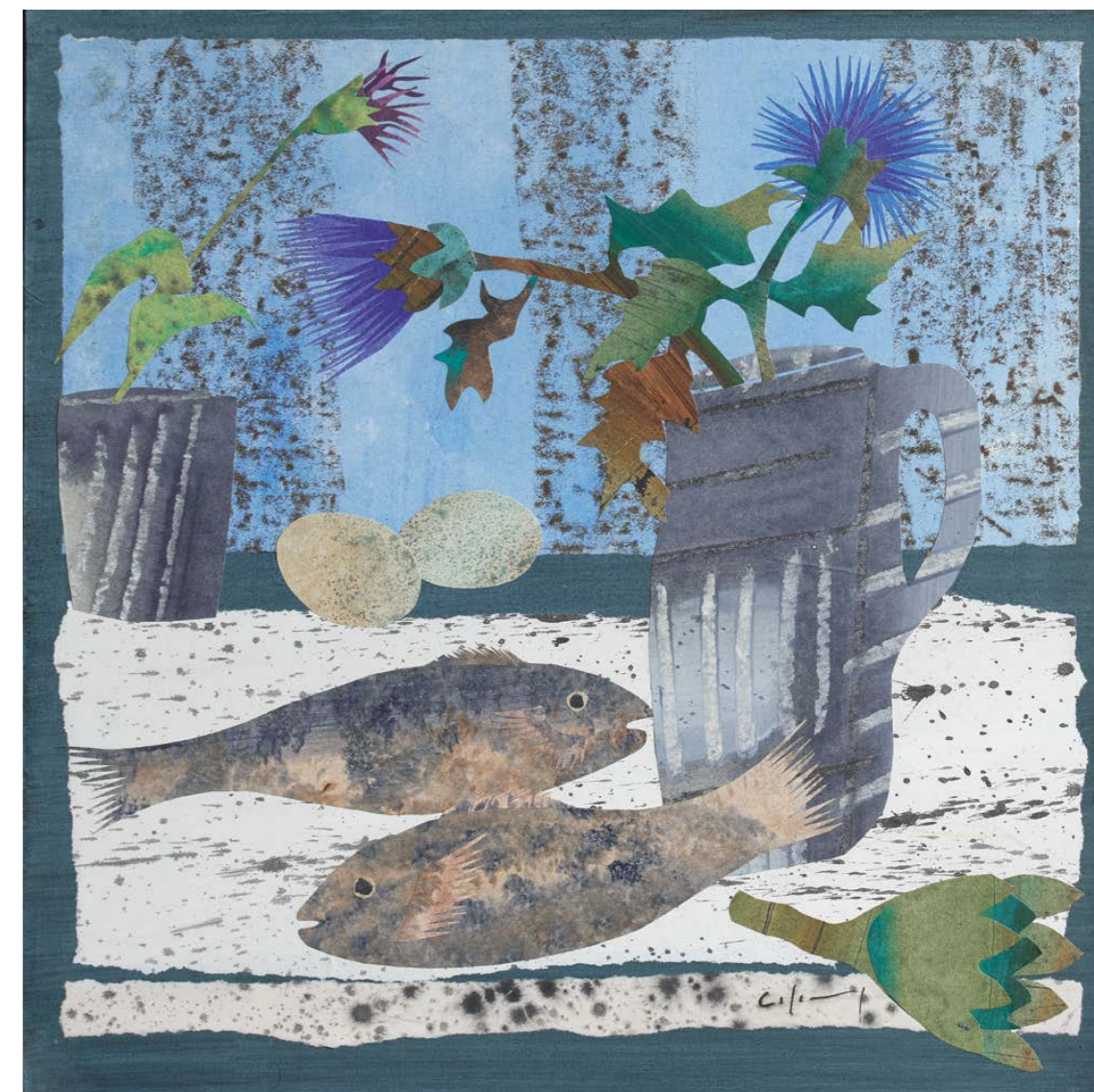
Artichokes and Fish Collage 16 x 16 ins Catalogue no.23