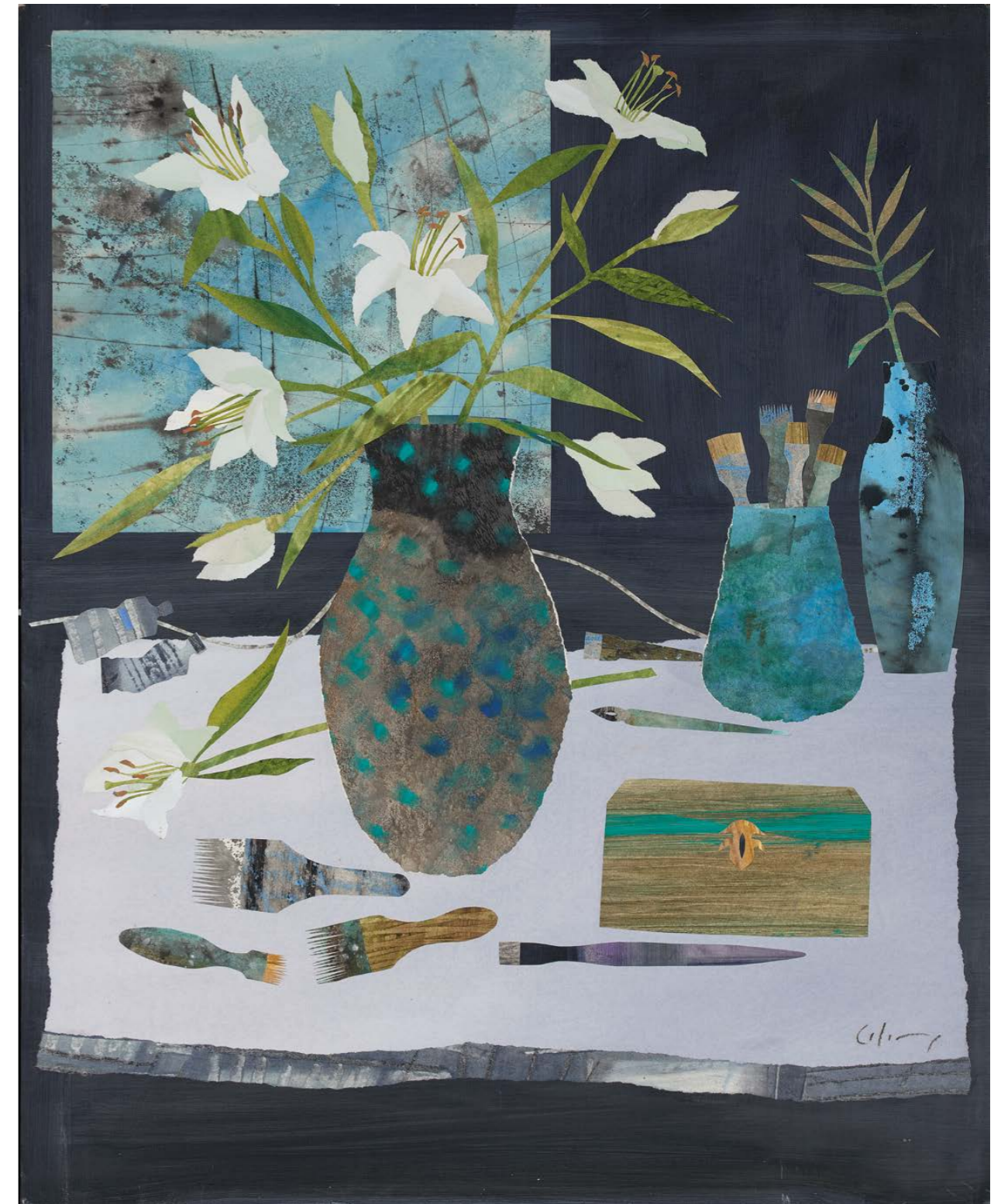
Right: The Box Collage 39 x 31 ins Catalogue no.11