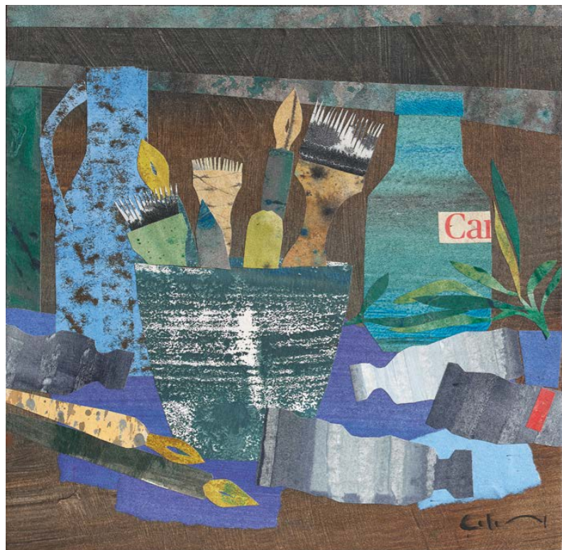
Brushes and Paints