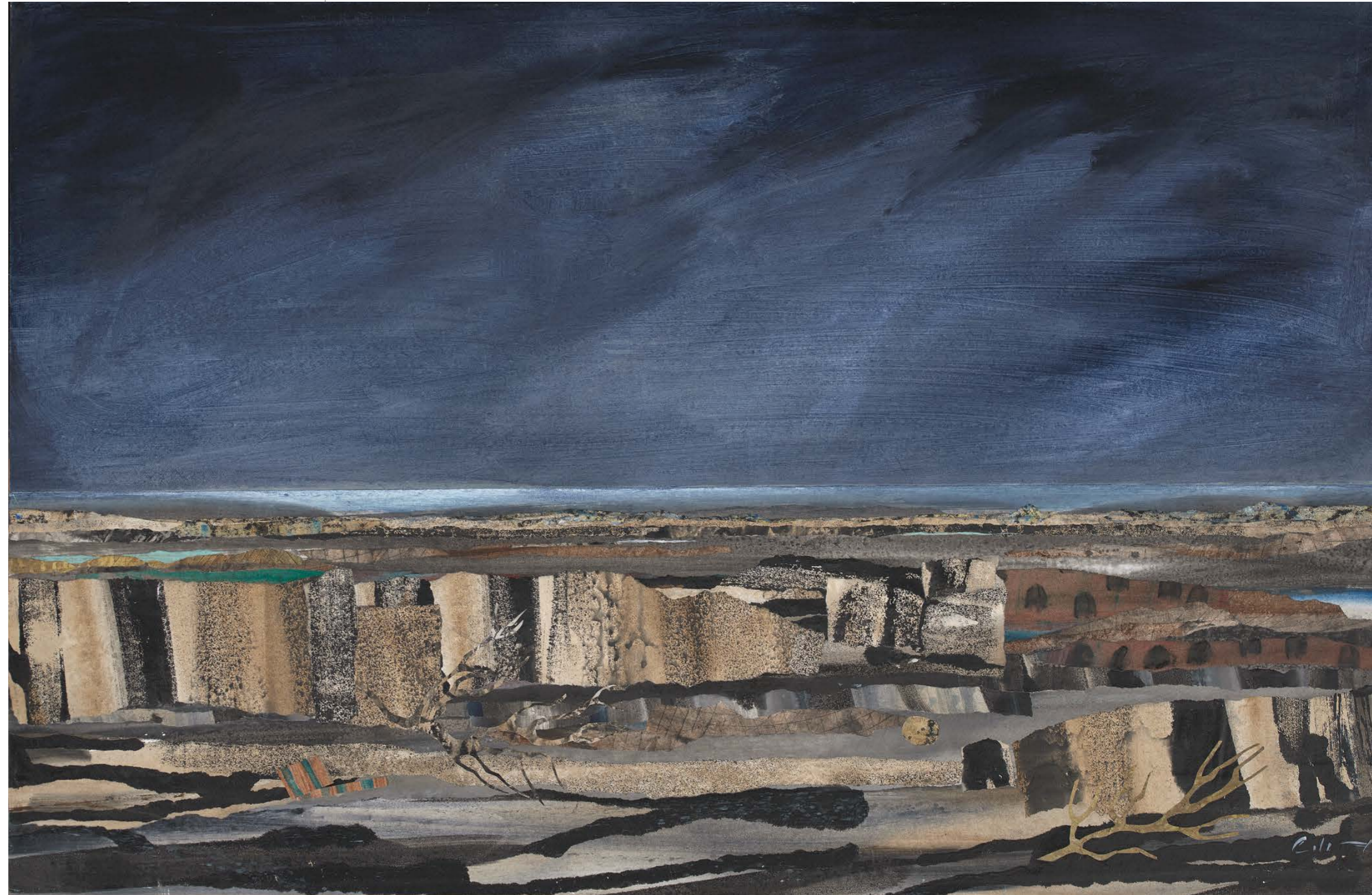
Storm at Sea