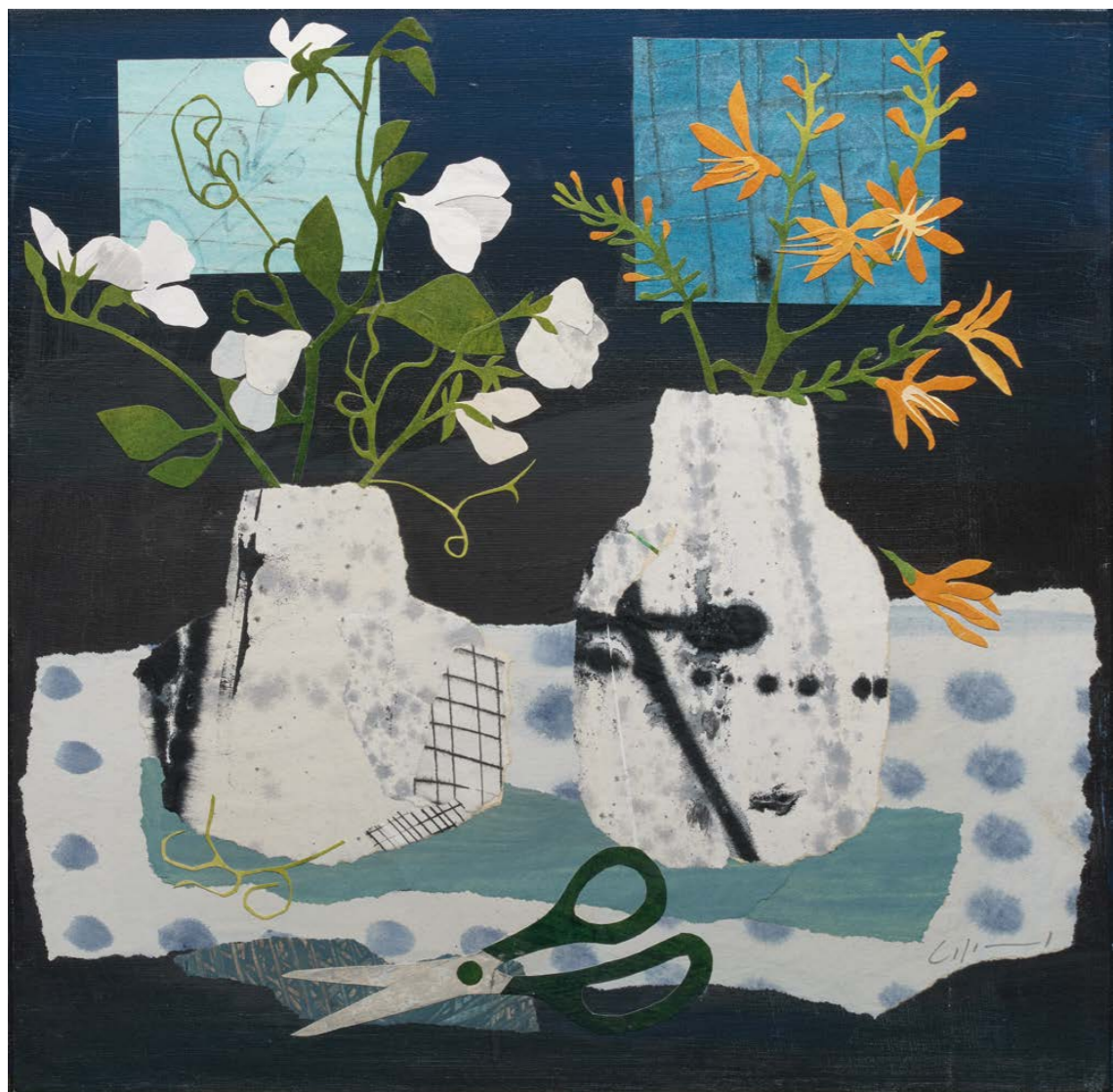
Sweet Peas and Crocosmias Collage 16 x 16 ins Catalogue no.27