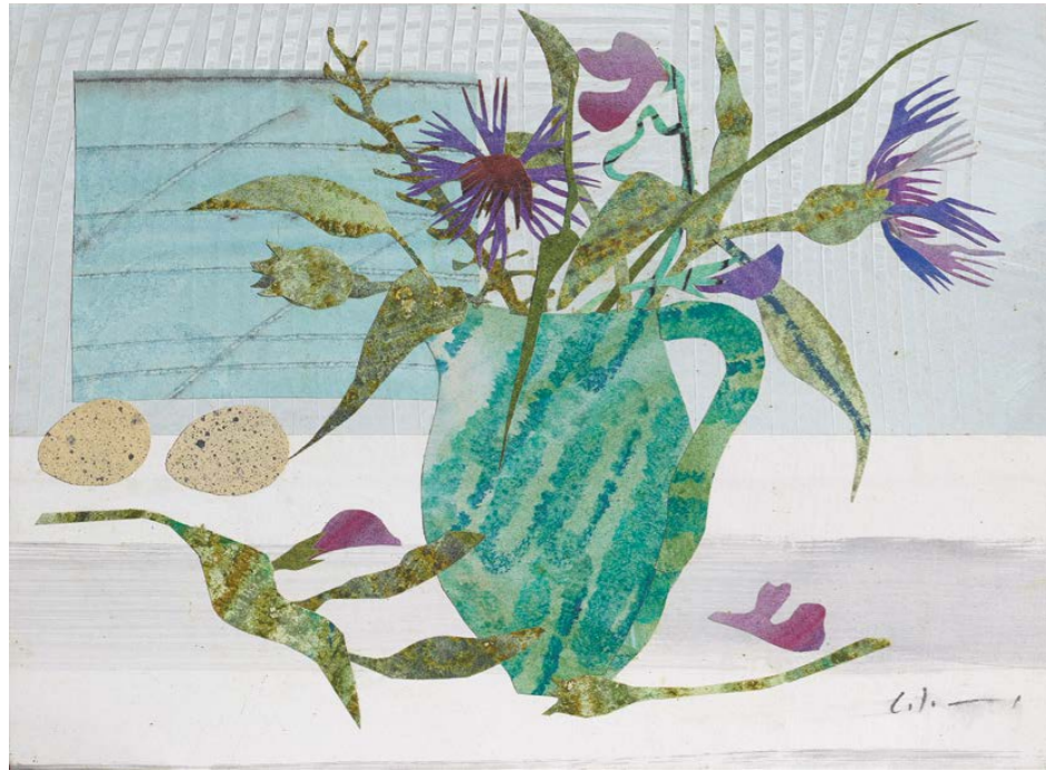
Flowers and Two Quail Eggs Collage 9 x 12 ins Catalogue no.41