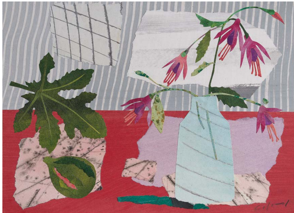
The Fig Collage 9 x 12 ins Catalogue no.38