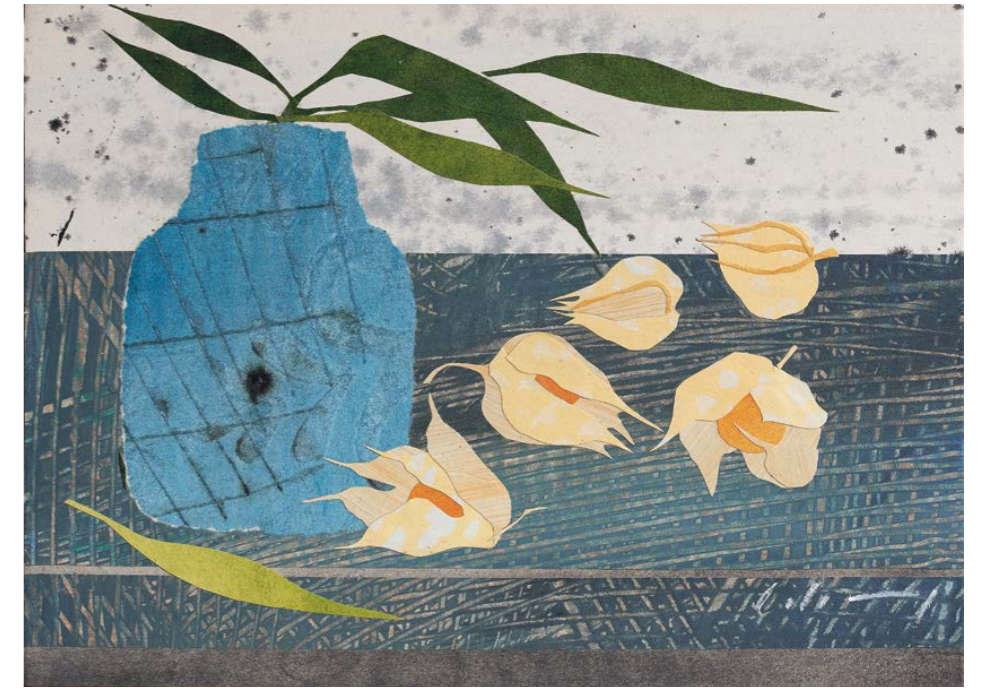
Cape Gooseberries Collage 9 x 12 ins Catalogue no.36