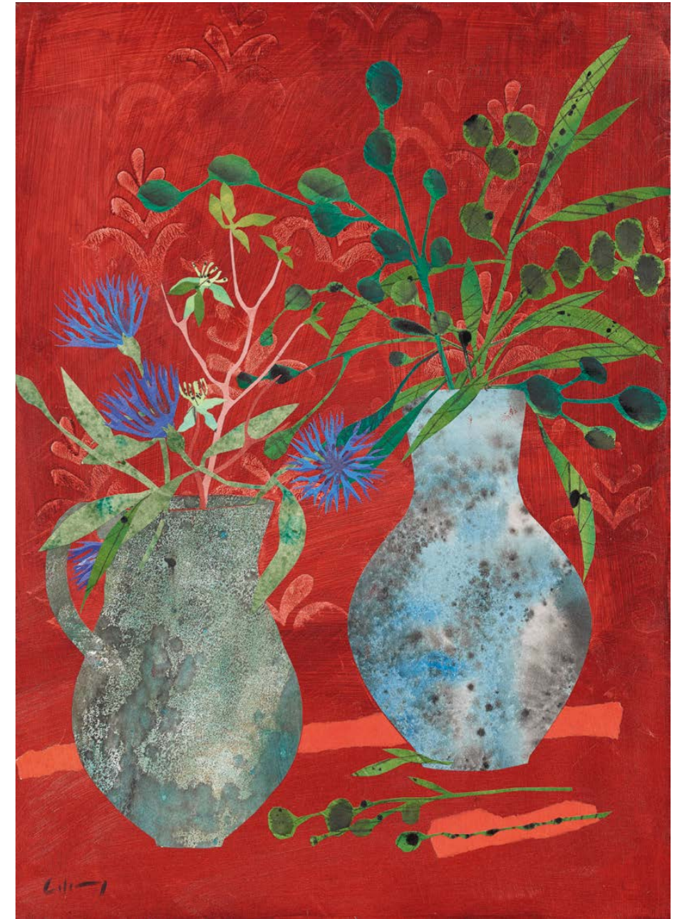
The Red Curtain