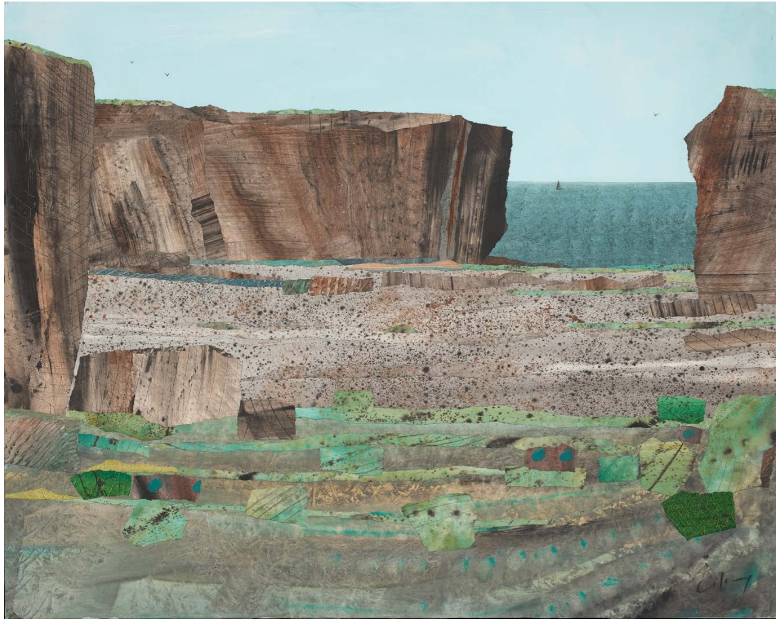
The Return Collage 32 x 39 ins Catalogue no. 8