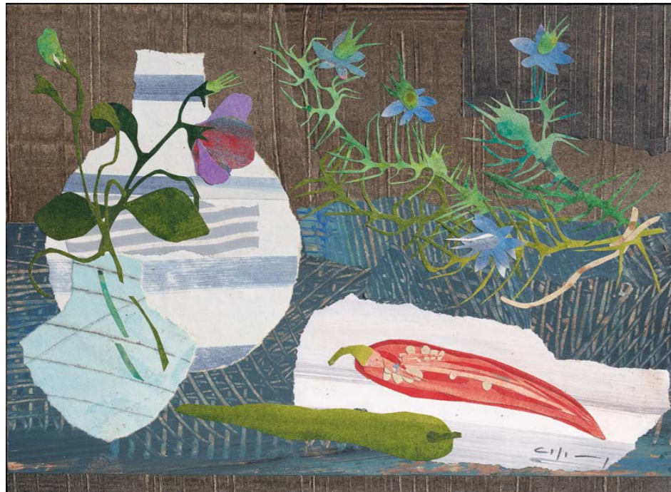
Love in the Mist Collage 9 x 12 ins Catalogue no.35