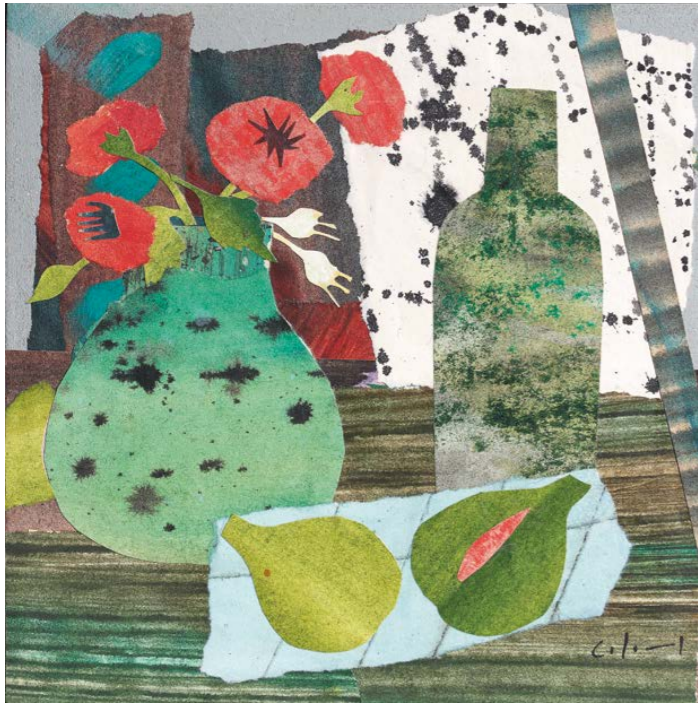
Poppies and Figs