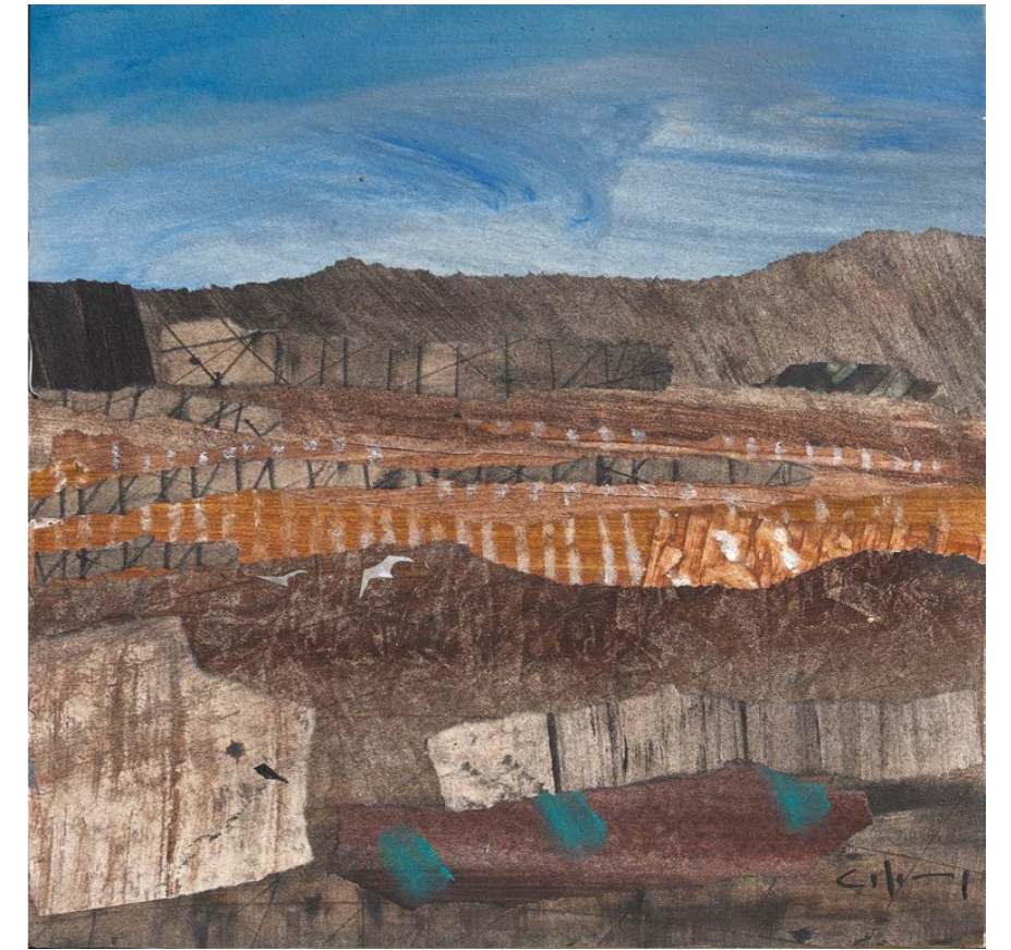
October Collage 8 x 8 ins Catalogue no.44