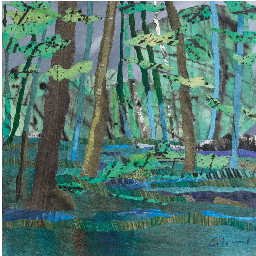
Woods in May Collage 16 x 16 ins Catalogue no.24