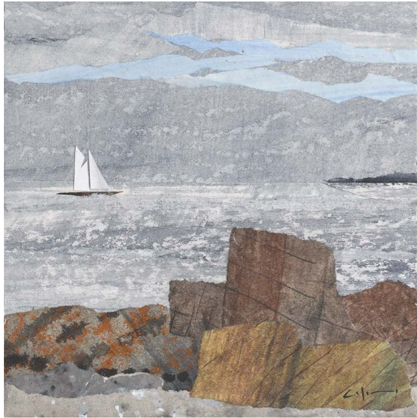
Two Mast Beauty