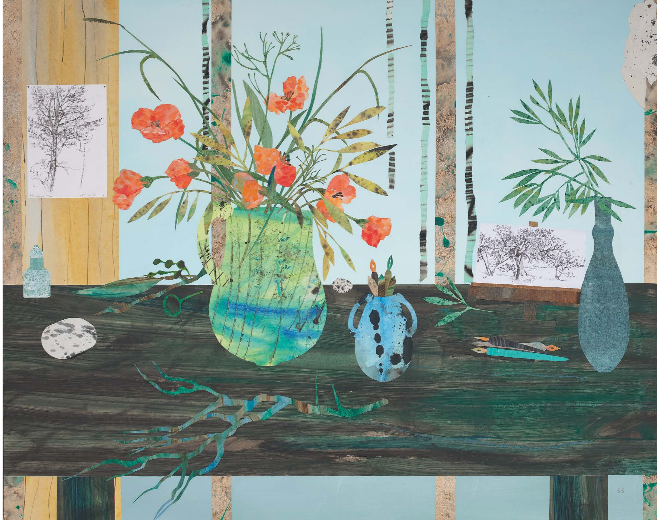
A Sunny Day in the Studio Collage 40 x 48 ins Catalogue no.1