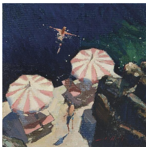
Pink Parasols - Oil on board, 51 x 51 cm / 20 x 20 in

"I don't believe I will ever of painting on the Riviera" – Paul Rafferty, 2025