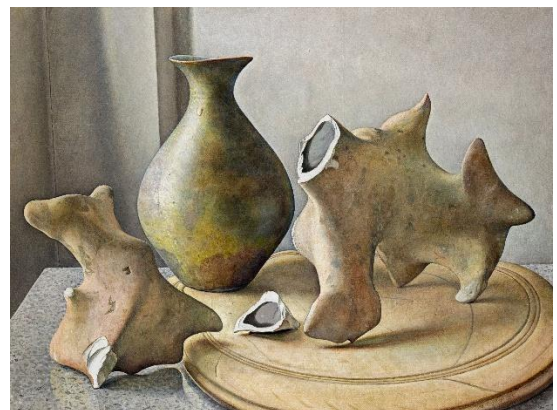
Korean Pots with Flints