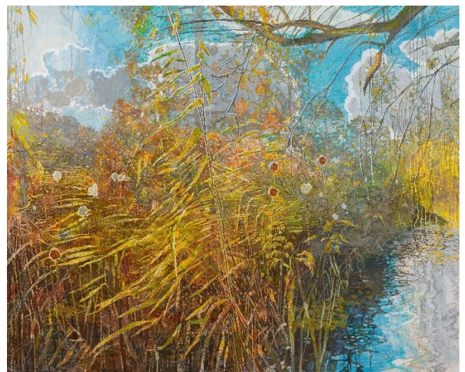
Moving Light, Richmond Park

The composition of each work focuses on the quiet moments found in vast, all-consuming landscape. In paintings such as Ionian Sea and Paddle Boarder , Stage depicts distant figures, providing an idea of scale and a narrative to her chosen landscape. The smallest brushstroke can depict a lone dog-walker or brave swimmer. The peace and solace that can be found in Stage's works are consistent throughout her painting practice, and particularly in the pieces selected for this exhibition.