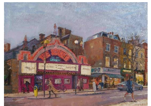
The Screen on the Green, Nightfall