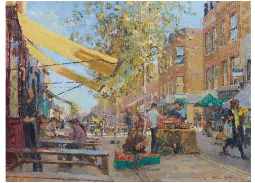
Chapel Market, the tomato seller